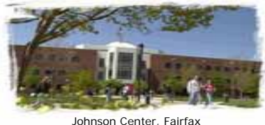
Johnson Center, Fairfax