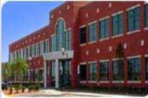
Innovation Hall Fairfax