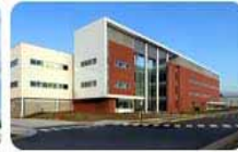
Bull Run Hall Prince William