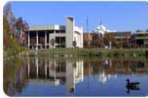
Center for the Performing Arts Fairfax